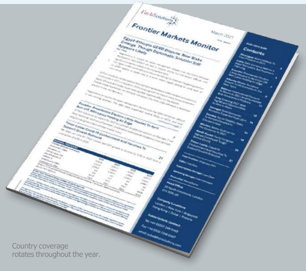
Country coverage rotates throughout the year.

Frontier Markets Monitor is the only monthly publication on the market dedicated to covering these rapidly growing economies in a 'one-stop' format. You get insightful analysis of the risks and rewards of these promising economies to inform your next strategic move when looking for markets with high investment potential.